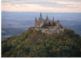
After falling under the sway of a destructive dragon, a prince struggles to break free.

The prince's apprehension melted into awe and exhilaration. From then on, he met the dragon often, but secretly, for how could he tell his father, brothers, or the knights that he had befriended the enemy? The prince felt separate from them all. Their concerns were no longer his